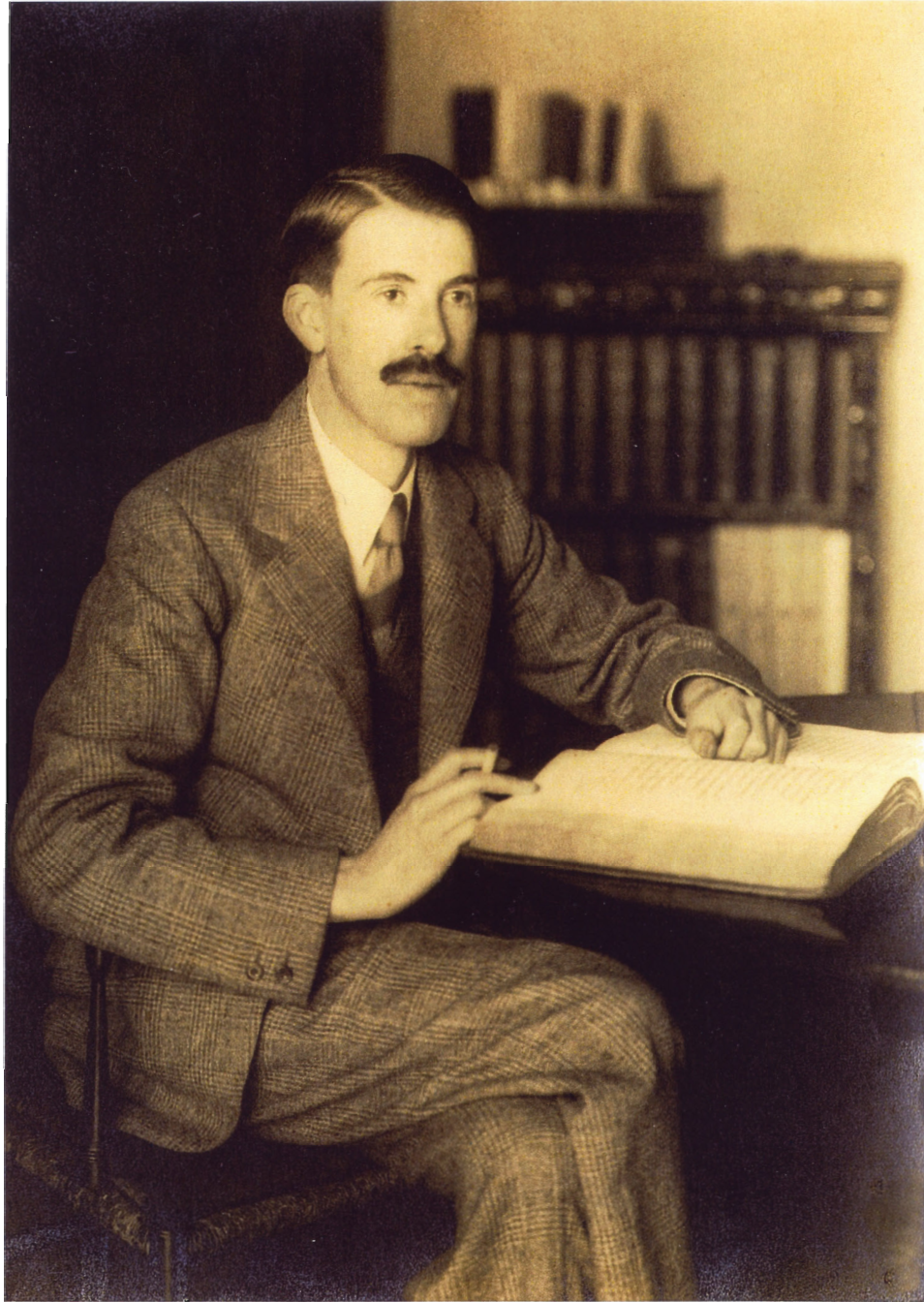
Christopher Dawson, ca. 1929